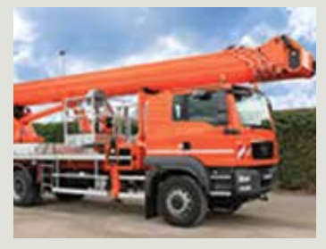
Multi-Chassis STEIGER<sup>®</sup> Brands

1 Altendiez Way, Latimer Park, Burton Latimer, Kettering. NN15 5YT T: 01536 721010 E: sales@ruthmann.uk www.ruthmann.uk