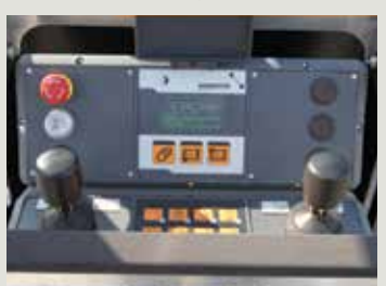
Display in work basket