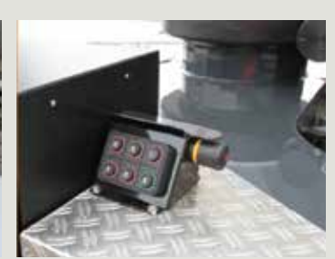
Chassis outrigger controls