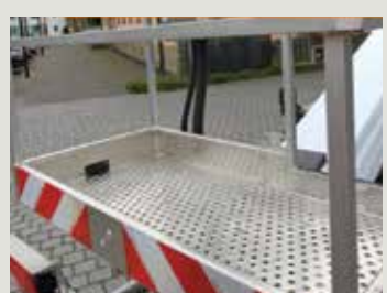
Perforated, non-slip floor